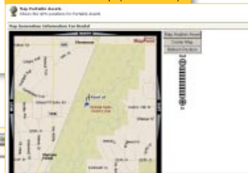
SAMPLE: GPS map (zoomed in)